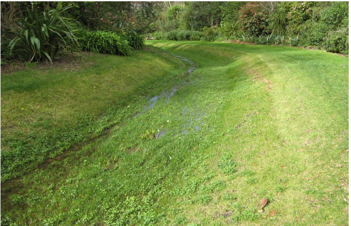
Completed vegetated stream