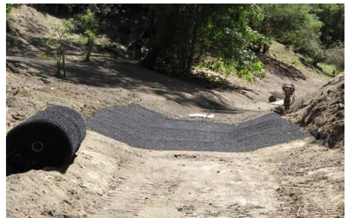
Placement of Enkamat