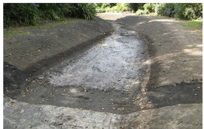
Unvegetated stream of flood