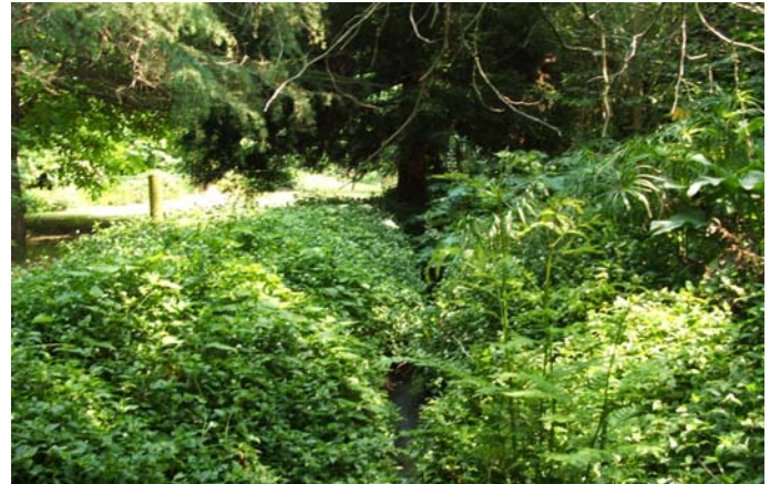
Site prior to construction