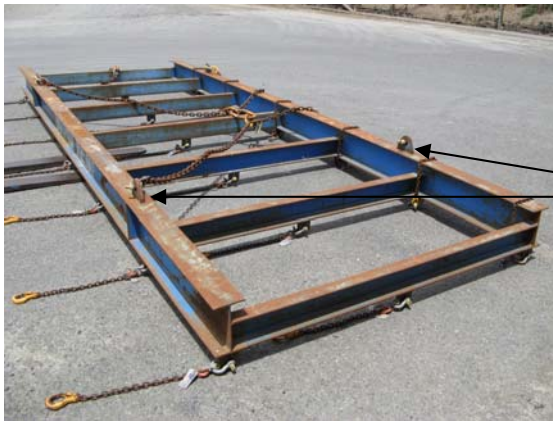
Main chain connected to the frame by shackle & swivel