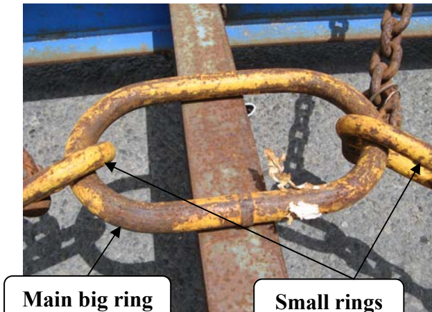
Main big ring