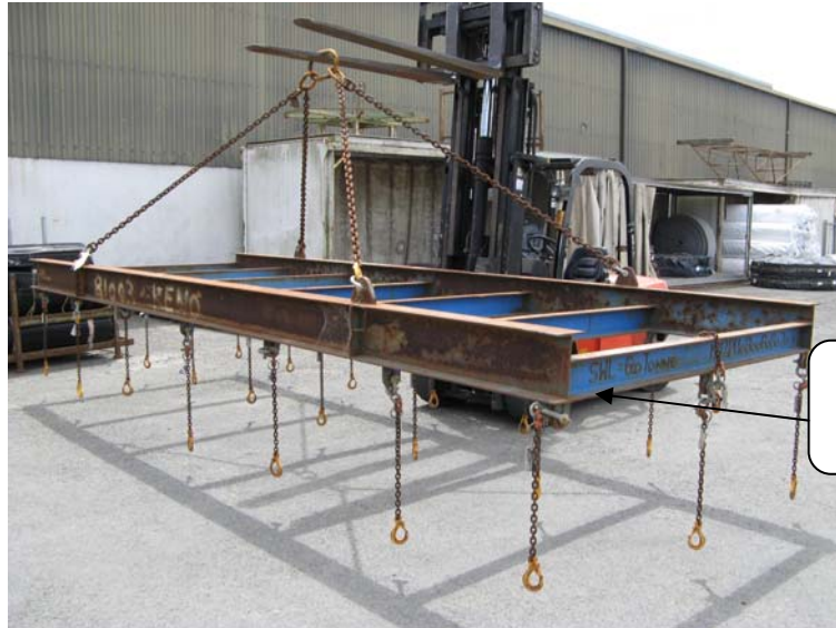
Fully assembled Reno frame