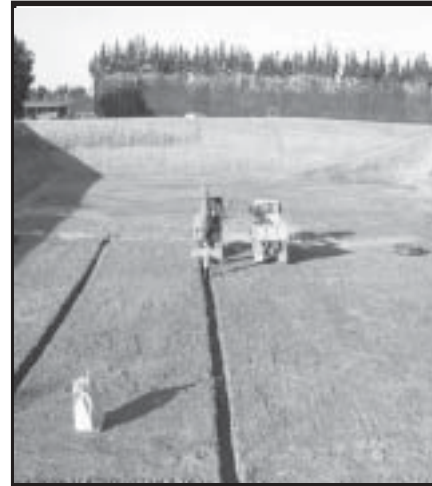
Megaflor installation on lagoon base

As a sand blanket would not have been practical on the steep slopes, Enkadrain was supplied to custom made lengths to reduce wastage. Enkadrain provided a gas flow path and prevented damage to the FML from the subgrade.