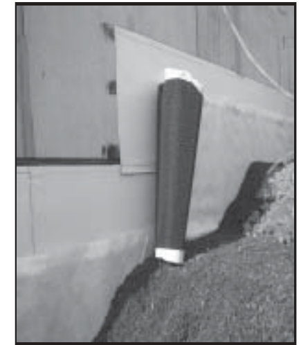
Placement of Cordrain over water proofing membrane

Importantly, Cordrain also provided a protection layer to the specialist water proofing membrane chosen for the Albany site. However, Cordrain has also been used very successfully with a range of building membrane materials to provide assurances against damage as well as the water collection function.