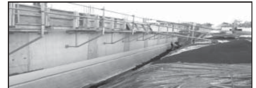
Cordrain installation prior to backfilling