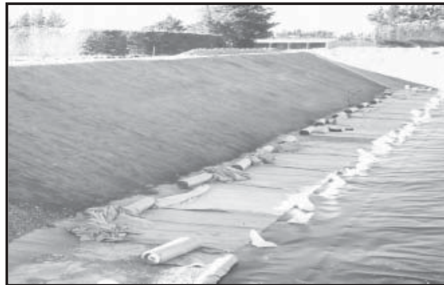
Enkadrain and Bidim ready for installation on slope