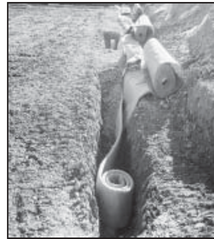
Enkadrain joining to Megaflor perimeter drain