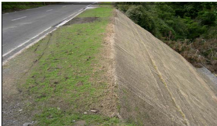
Complete structure prior to revegetation