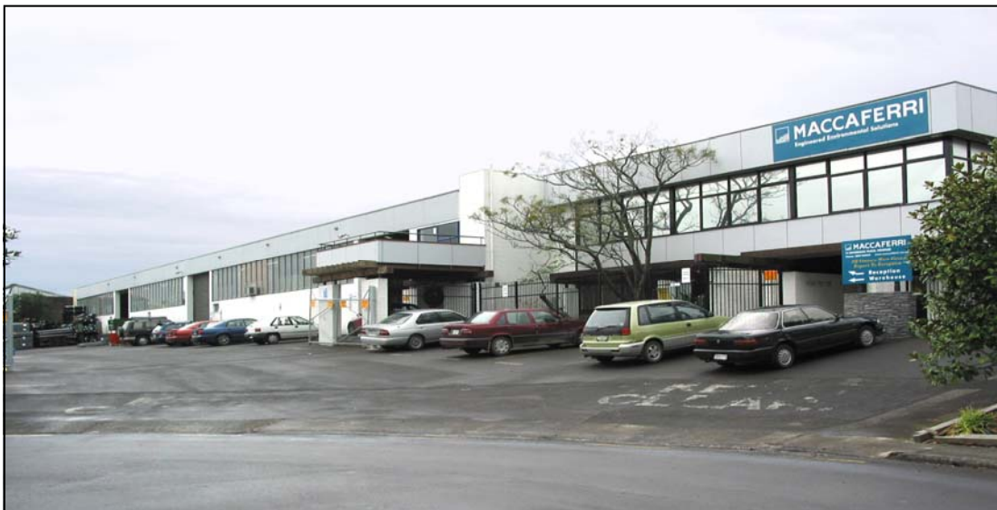
New Office and Warehouse at 14 Goodman Place, Penrose, Auckland

A fter some years at the original Auckland facility, we have made the big move..... actually the physical location is literally next door, but the relocation in June represents a significant milestone in the continued growth at Maccaferri as we changed from using a contract storage and distribution centre to our own store and own stores' people. The new premises offer improved logistics all around and include increased yard, warehouse and office space.