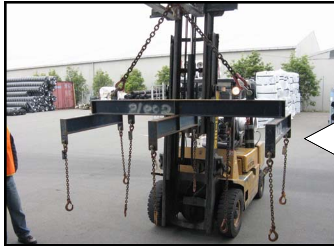
Fully assembled Gabion Lifting frame