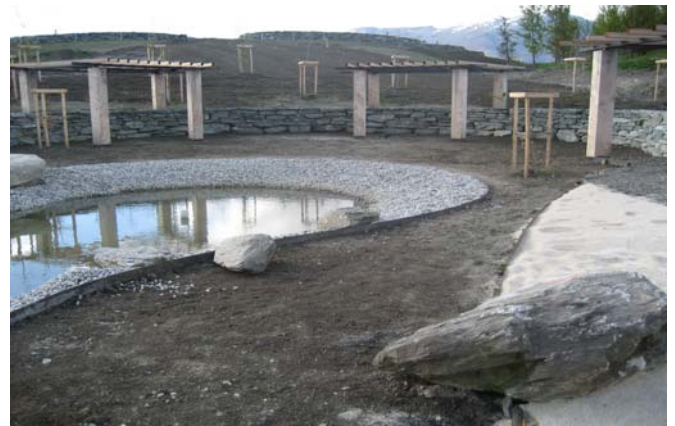
Area prepared for ECO Rain® installation

The system is governed by a battery operated timer with Morgan & Pollard keeping statistics on water usage. Approximate water usage for 229m 2 is 519 litres per day, with station run times of 8 minutes during normal water cycles.