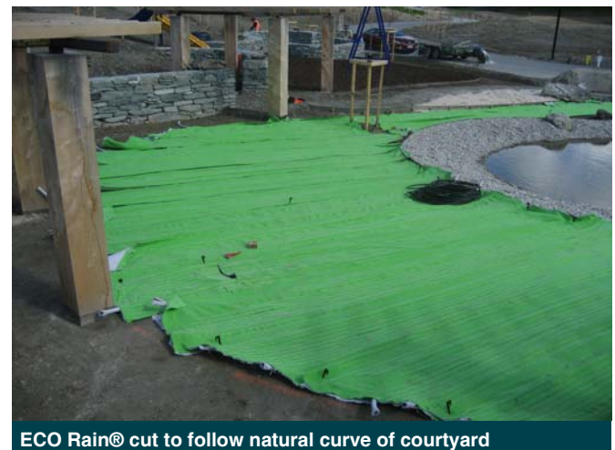
ECO Rain® cut to follow natural curve of courtyard