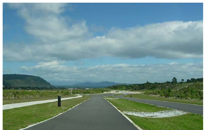
Completed installation with VersiTanks underground