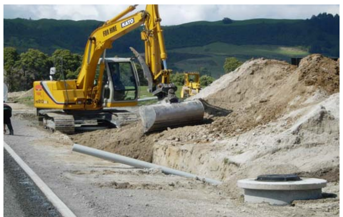
Excavation ready for VersiTanks