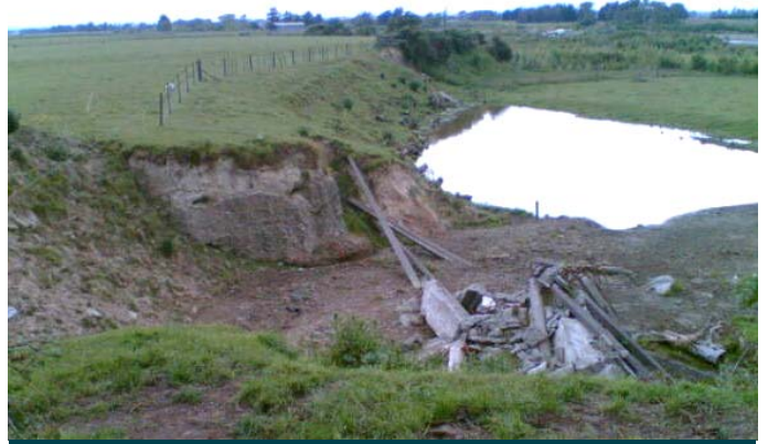
Site prior to construction