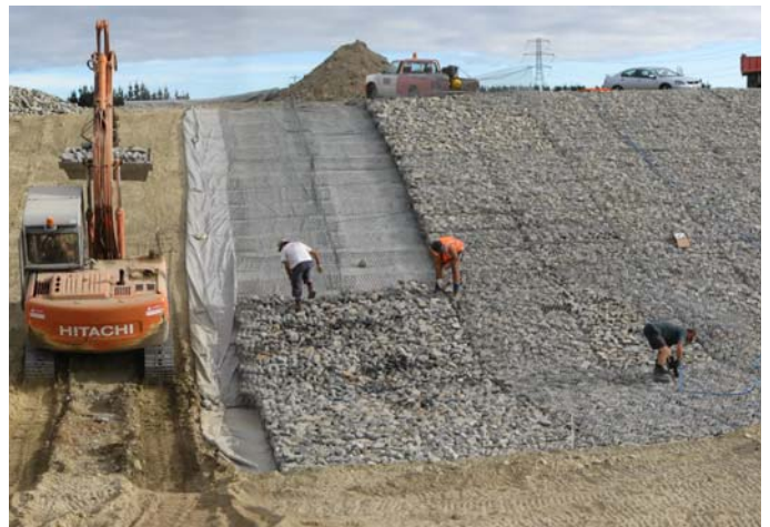
Reno mattress installation