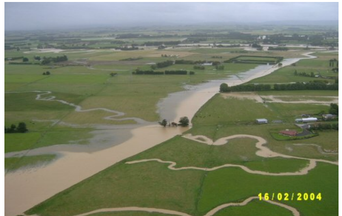
Inundated Manuwatu Farmland