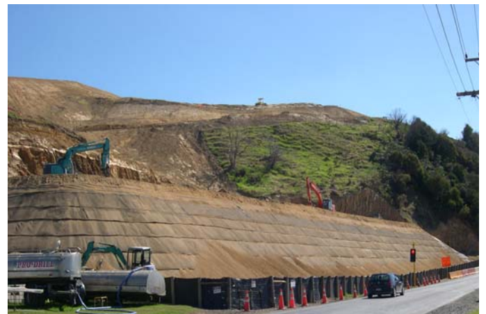
Building of the reinforced soil slope