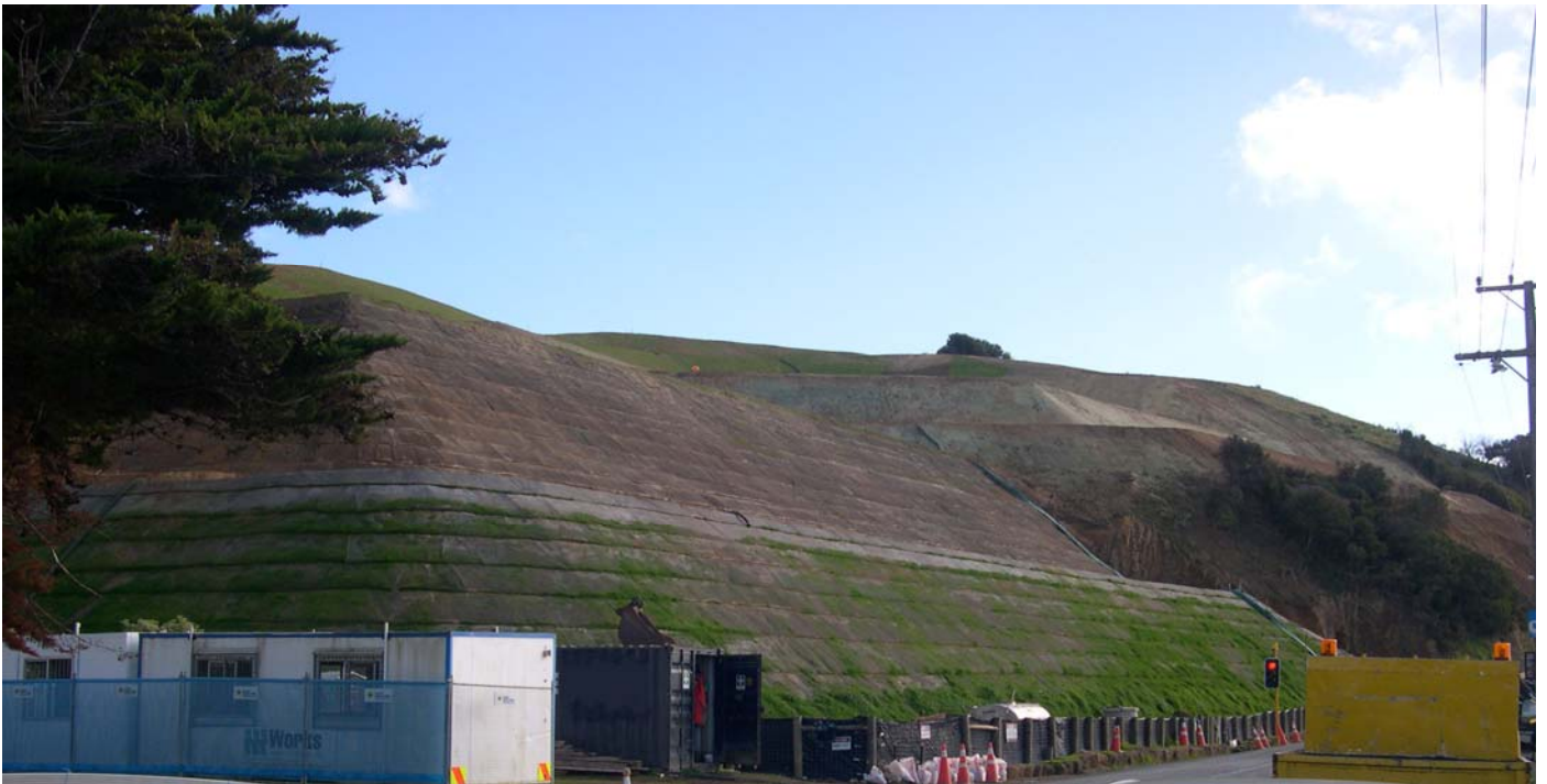
Completed Miragrid & Grasstrike reinforced steep soil slope