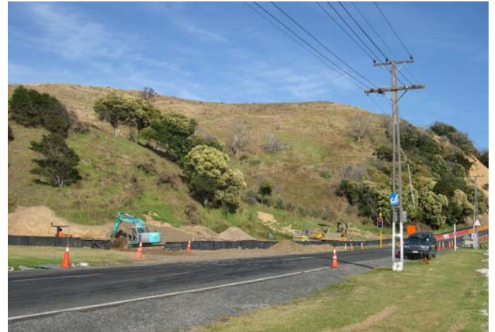
The initial site before construction