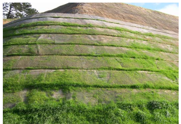
Greening of the reinforced soil slope