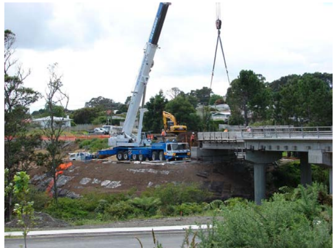
300T crane operation

No deformations or distress to the structure was observed during the critical phase of placement of the bridge elements. These observations supported the design principles adopted for this site.