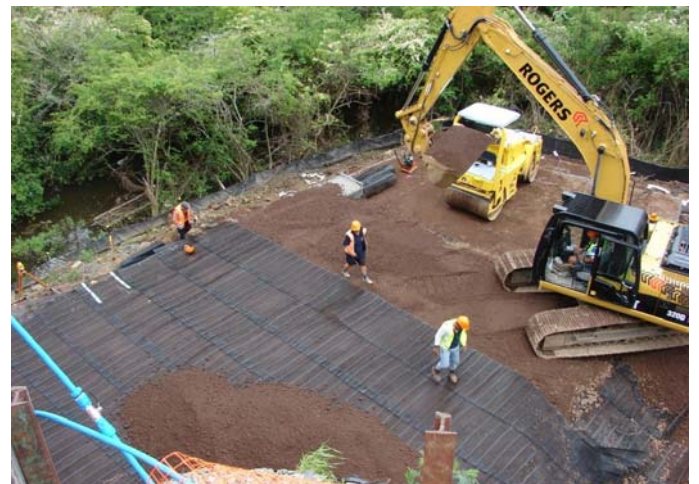
Placement of geogrid & fill