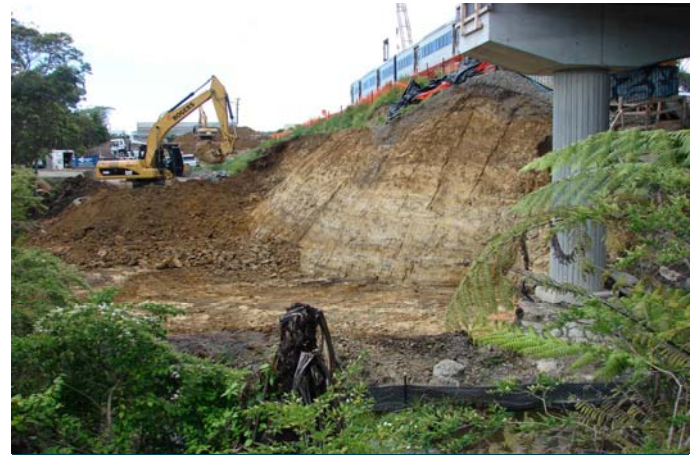
Site prior to construction