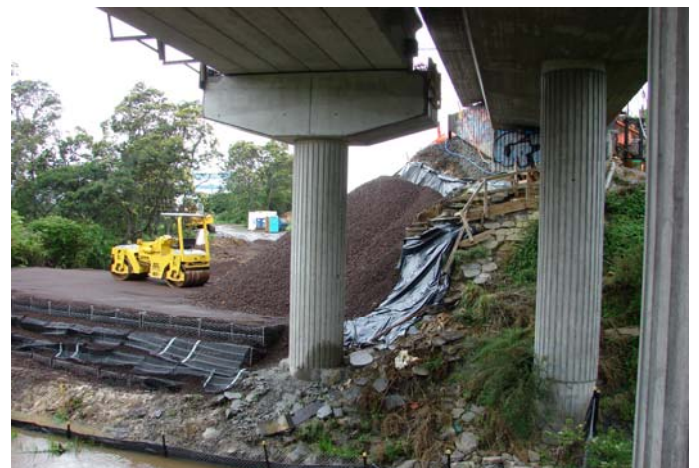
Lower prefilled gabion section